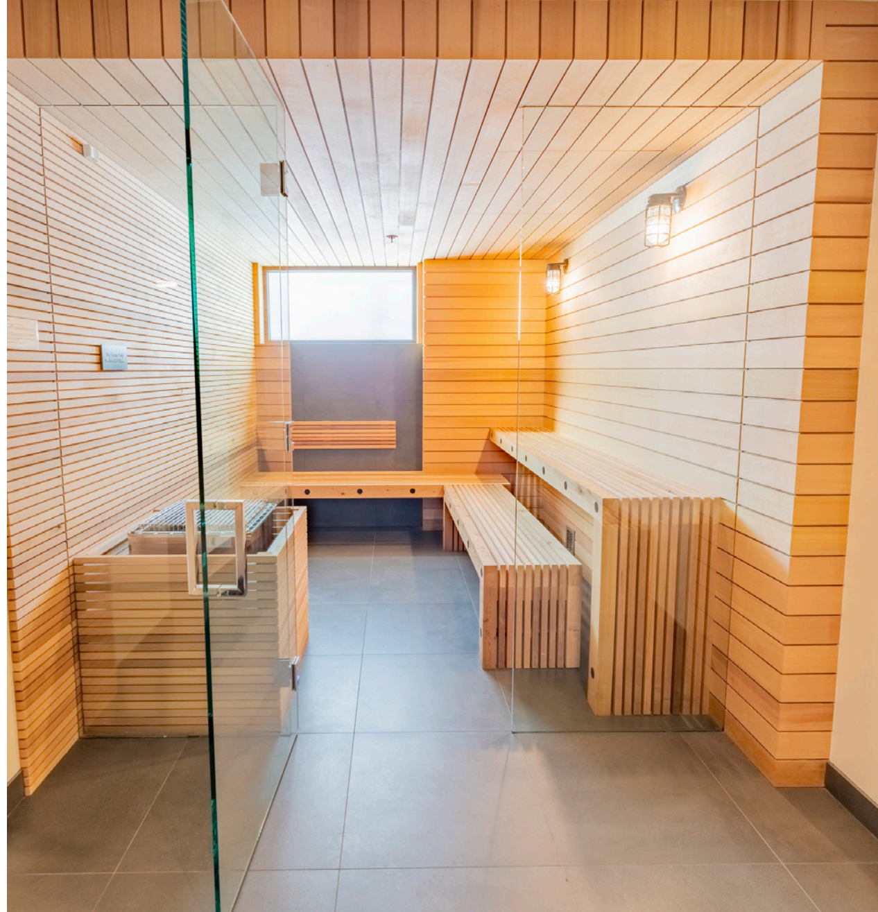
GYM AND SAUNA