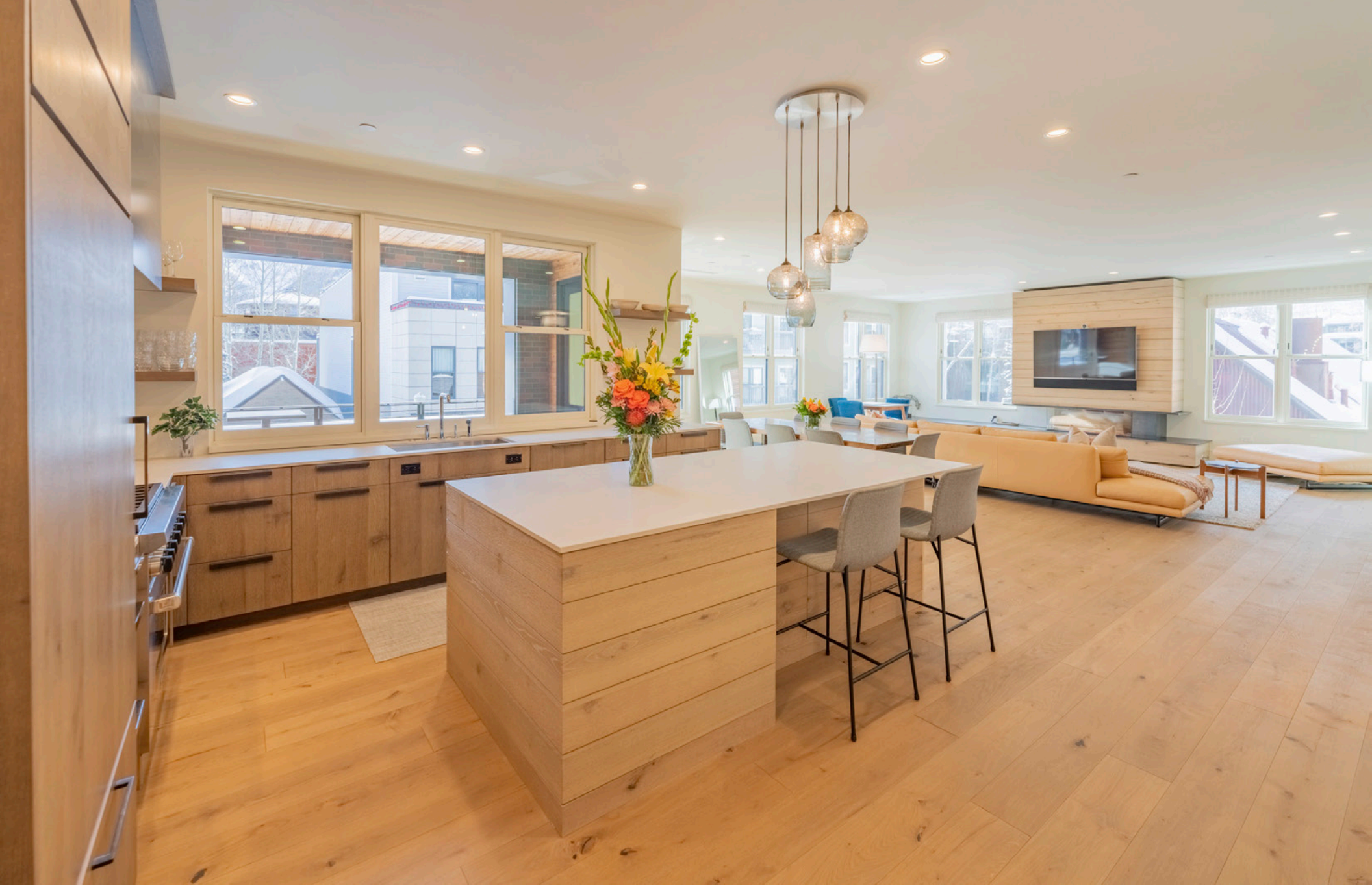
Fir House Two Telluride, Colorado